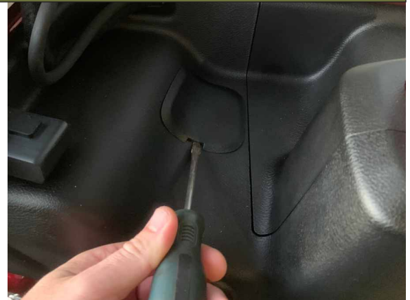
Removal of interior cover

Repeat process for opposite side of vehicle.