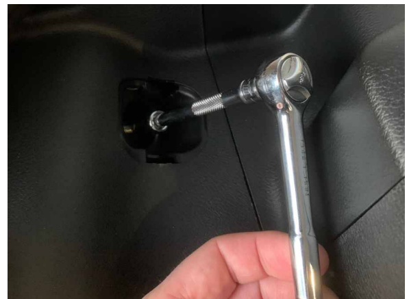
Removal of retaining hardware