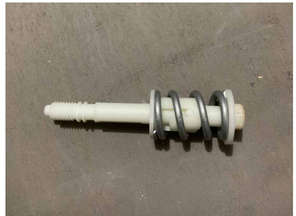
Factory hardware reference